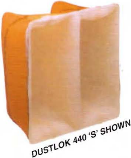
DUSTLOK 440 'S' SHOWN

ALSO AVAILABLE IN A 3 POCKET DL 660 DESIGN