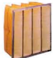
DL 30 - HC

Dustlok®, Spor-Ax® and Poly-Perf® are registered trademarks of Fiber Bond Corporation.