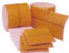
ROLLS, CUT PADS & POLY-PERF®