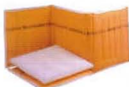
DL PANELS & LINKS