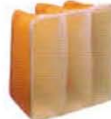
DL 660 CUBE